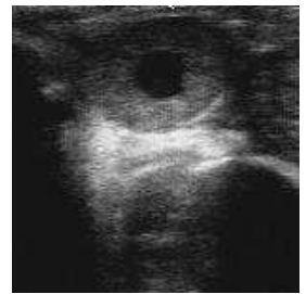
Cavitory corpus luteum