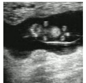
Pregnancy 55 days